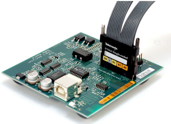
P5960 34-channel D-Max probe

For applications where circuit board space is limited, the 34-channel high-density P5960 D-Max offers the smallest available footprint and a quick connection mechanism.